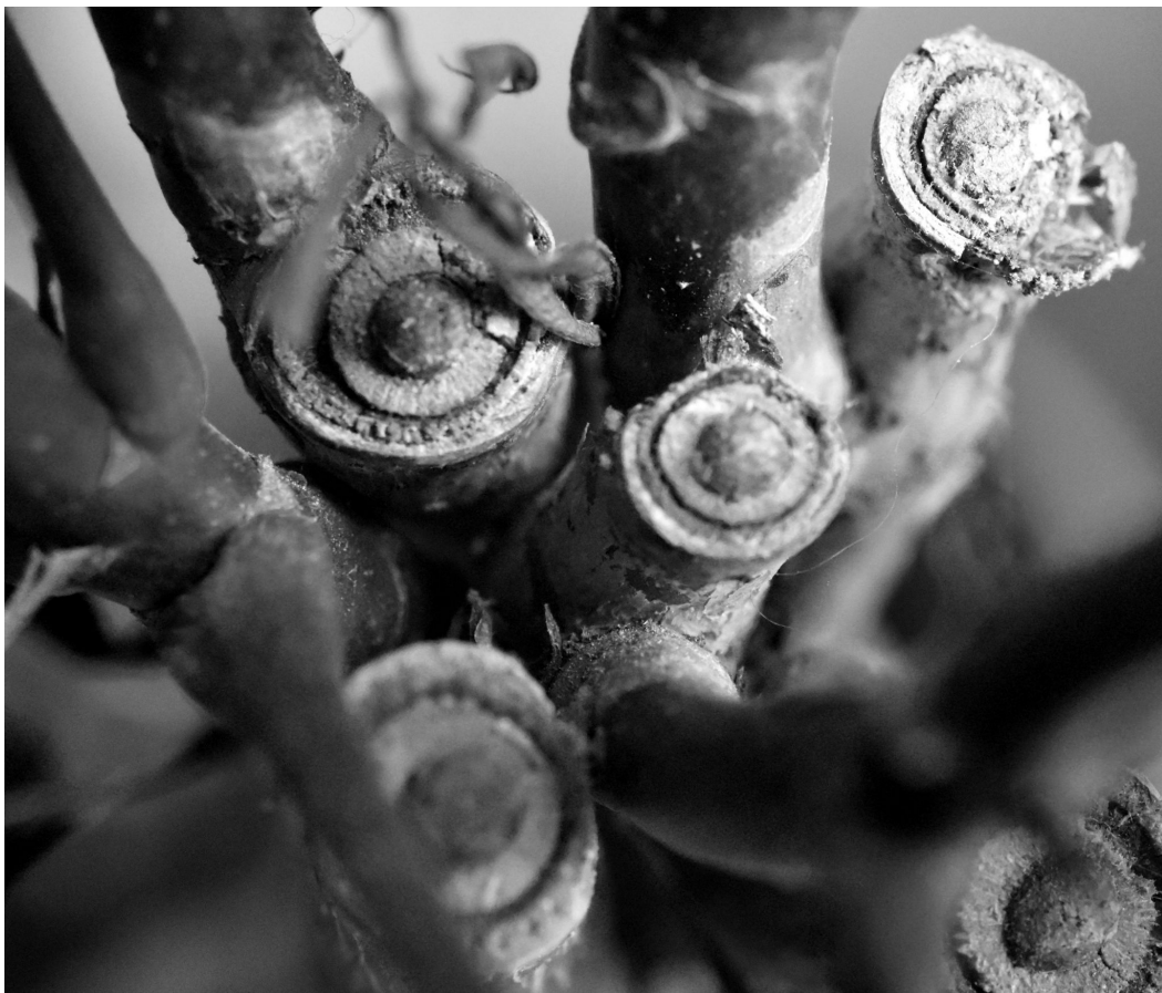
Concentric Digital Photography Macro Lens