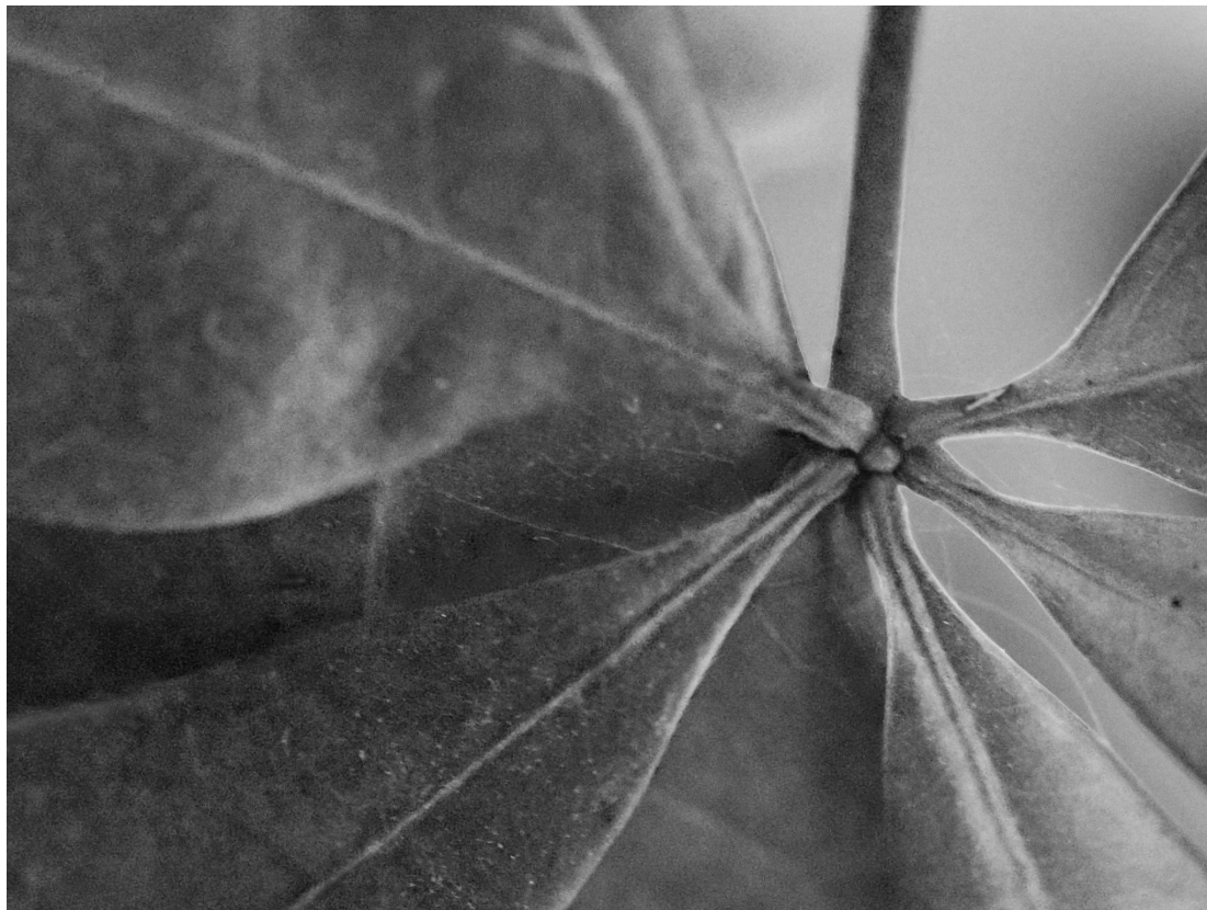
Radial Digital Photography Macro Lens