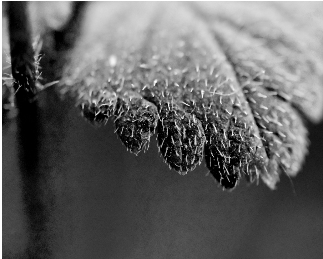
Tiny Hairs Digital Photography Macro Lens