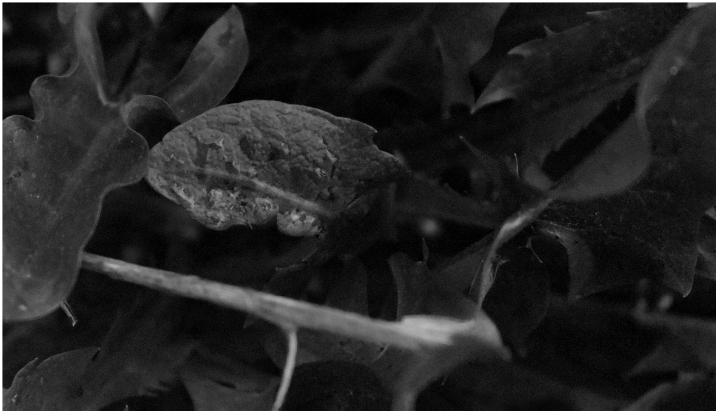
Into the Weeds Digital Photography