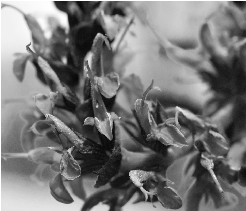
Branching Out Digital Photography Macro Lens