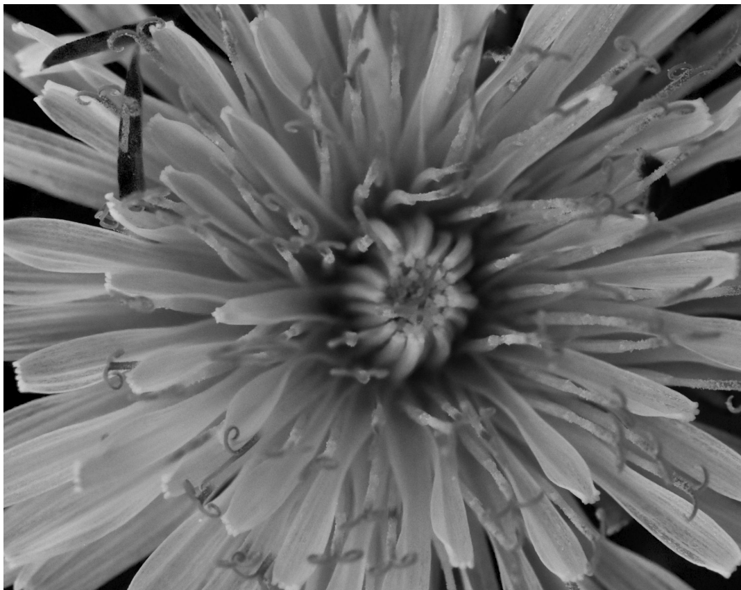
Just Dandy Digital Photography Macro Lens